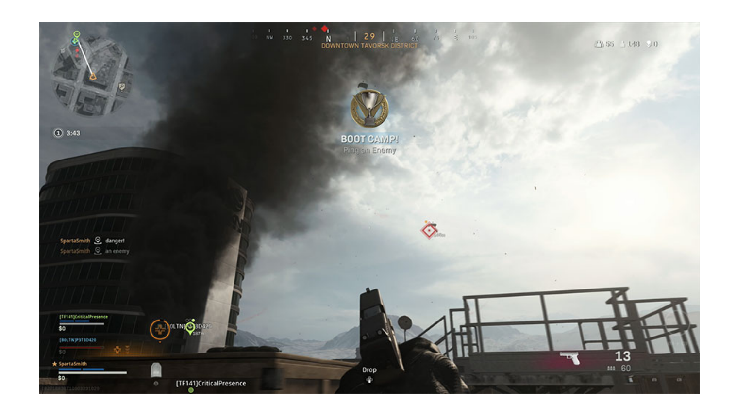
Battle Royale Bootcamp Keygen Download Pc